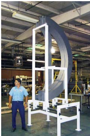
C - CHUTE